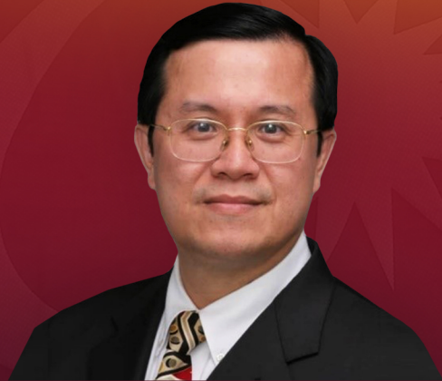
TAN SRI ONG TEE KEAT

Chairman, Centre for New Inclusive Asia, Malaysia